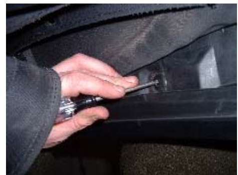
Clips at Rain Rail