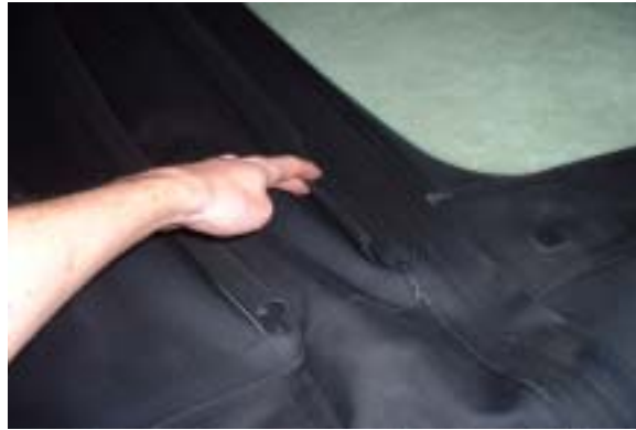
2000-2001 Convertible Cloth "Attachment"

NOTES: Plan 10 hours to complete. Defroster hookup not addressed. Diagram of convertible parts included on page 6. Need: 18 – 4mm, 2 – 8.5mm, and 1 – 10.5mm rivets, 24" of 1.5" black elastic band, 48" of 1" black nylon strap, and 4mm double-sided automotive tape. Not responsible for damage YOU do to YOUR car.