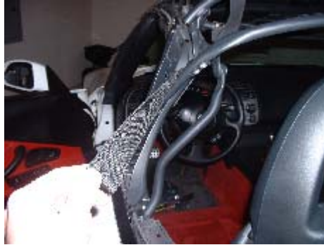
Rivet Nylon & Loop around Bow