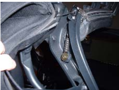
Tension Spring & Screw