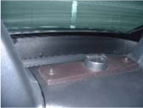
Upper Rear Tray, Portion of Lower Side Tray