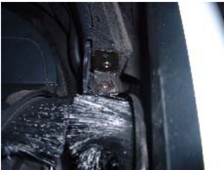
Set Plate A (top) & B (bottom)