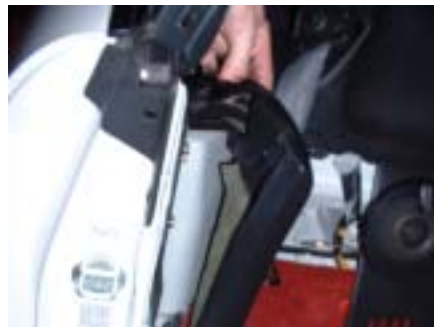
Rear Side Trim