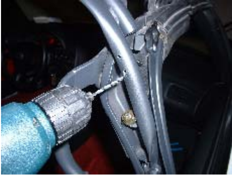
New Holes at Rear Frame