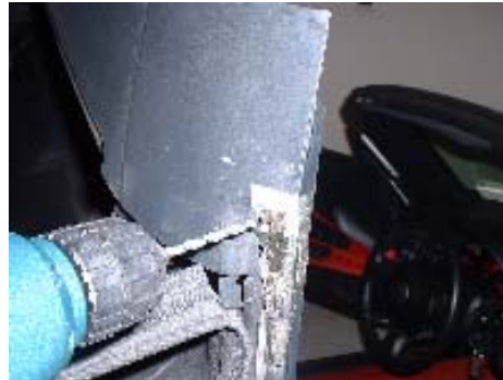
Rivet at Tension Wire