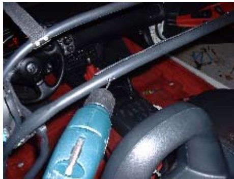
Holes at Rear Bow