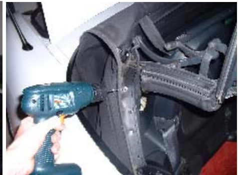
Rivets at Frame Pillar