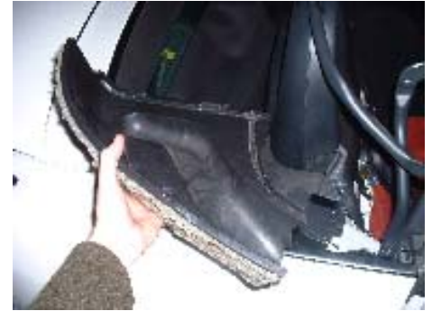
Side Tray Removed, Lip Revealed