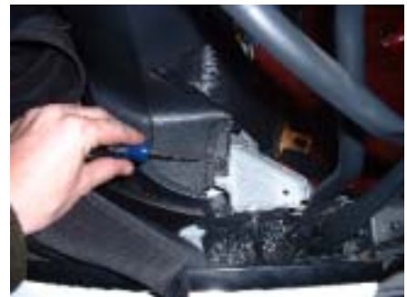
2 Screws at Roll Hoop Trim