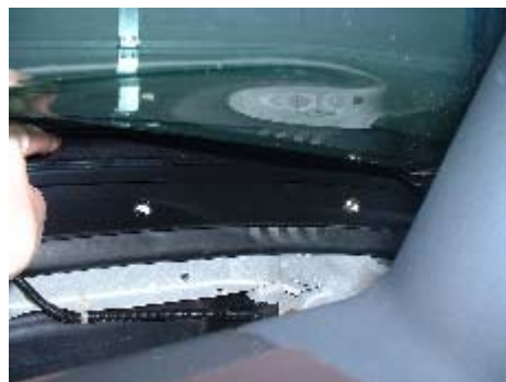
Rear Top Retainer & 10 mm Nuts