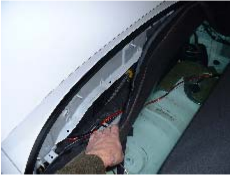
Rain Rails & Posts