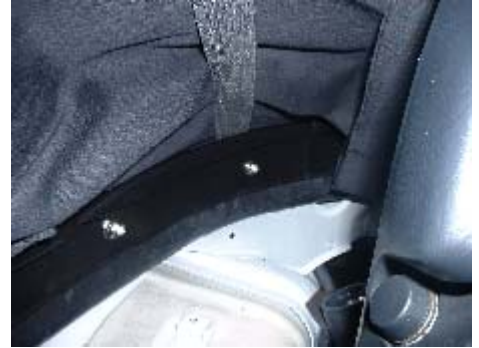
Nylon Strap attached to Post

* If you are uncomfortable drilling holes in the convertible top frame you can loop the nylon straps and elastic bands around the frame and sew in place. Apply automotive double sided tape to hold them in place on the frame.