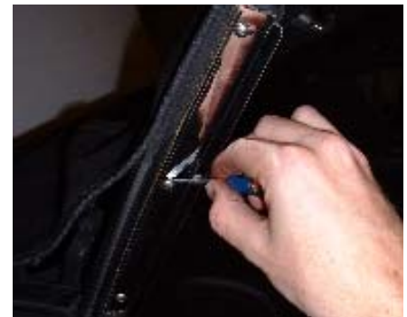
Roof Retainer, Scribe, 3 screws