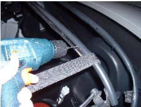
Holes at Middle Bow