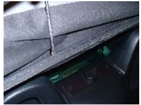
Cloth Retainer, Pry