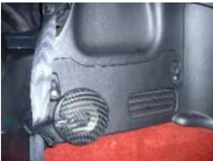
Rear Panel Trim