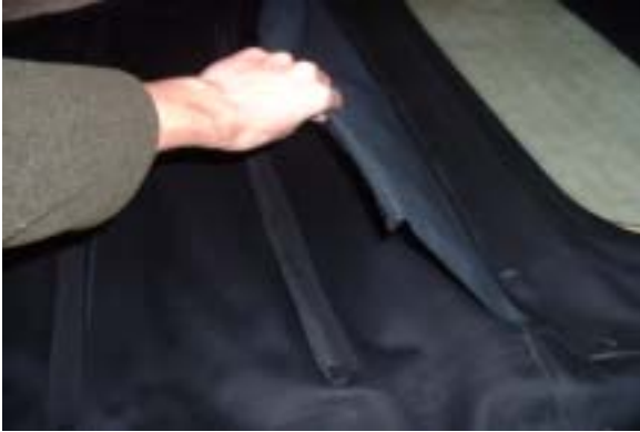
2002 Convertible Cloth "Sleeve"

So how do I make it work? Similar to the elastic band that currently connects the middle frame bow to the front; you will need to connect the rear bow to the middle bow with elastic bands. This helps the frame collapse when lowered reducing stress on the glass window. More importantly, you will need to connect the rear bow to the lower convertible top retainer with nylon straps. This pulls the rear bow back when the top is raised ensuring the proper upright position. Four straps are all it takes!