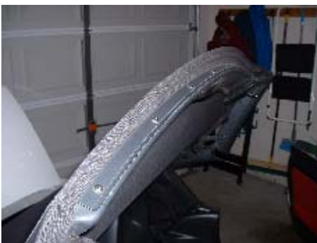
Front Frame Retainer, 7 Screws