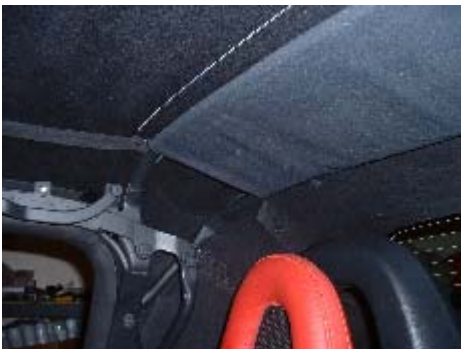
Cloth Sleeve, Elastic Bands Hidden