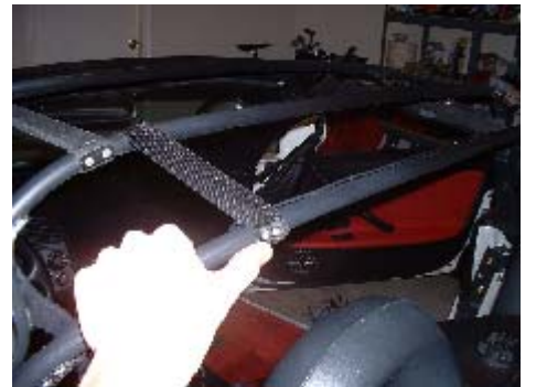
Elastic Band Riveted