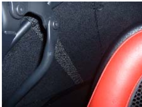
Nylon Strap, Rear Bow to Retainer