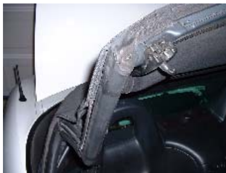
Weather Strip, Side and Pillar